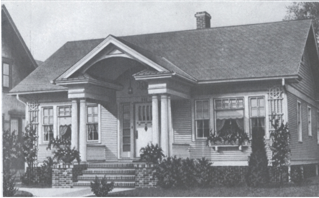
FIVE ROOMS – NEAT PORCH

Casa Kit Homes are inspired by the historic Sears Roebuck kit homes of the 1920s.